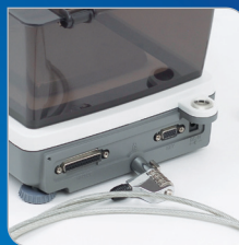
Kensington Security slot