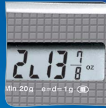
lb : oz